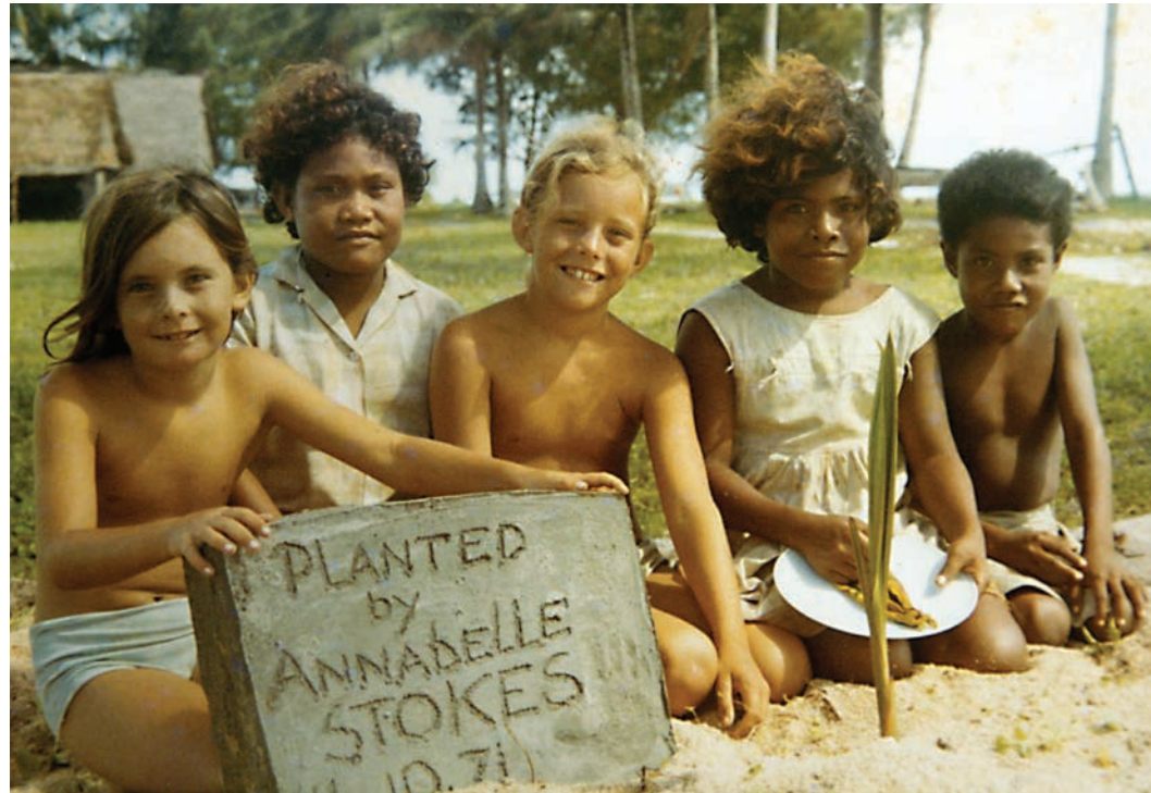
Schooldays ... (from left) kids at a tree planting on the island in 1971; filming canoe races (centre); the sails go up in the annual Niningo canoe races.